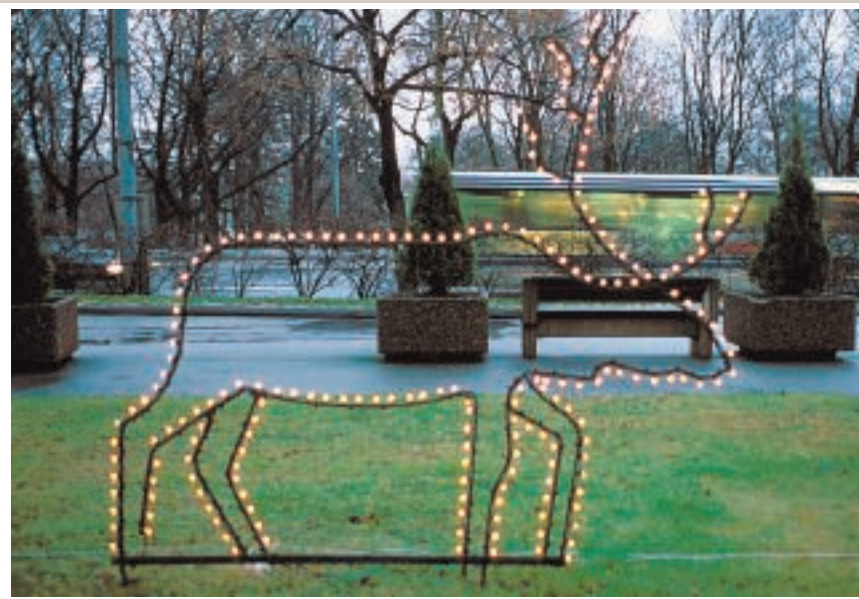
Reindeer forecast . . . Helsinki in winter

Aer Arran’s (0870 876 7676, aerarran.com ) Luton-Galway service operates three times a day all winter, from £76 return. Galway’s pubs are